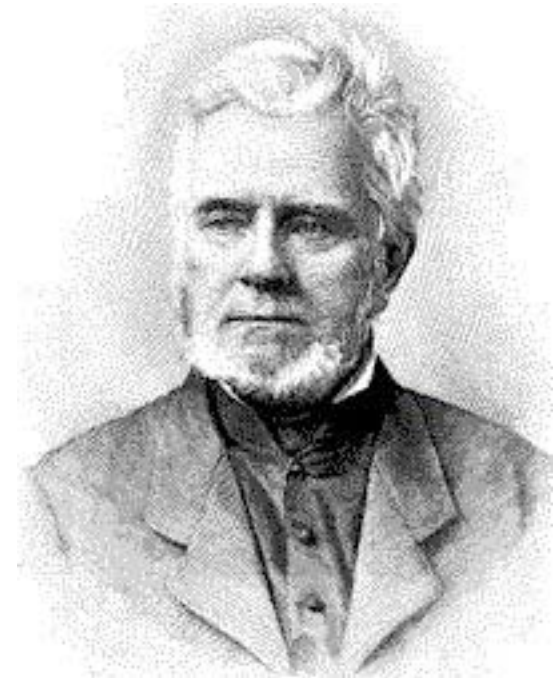
Lowell Mason, ca. 1860

Directions: Take the electric shuttle (next door to the ChooChoo) to the front of the Tennessee Aquarium. Walk left around the aquarium toward the river. Then left down the river two blocks. You will see the dock on your right. This is a two and a half block walk, and it will be very warm. Allow yourself sufficient time, and take a bottle of water. Remember, it can be very hot in Tennessee at this time of the year. Keep cool.